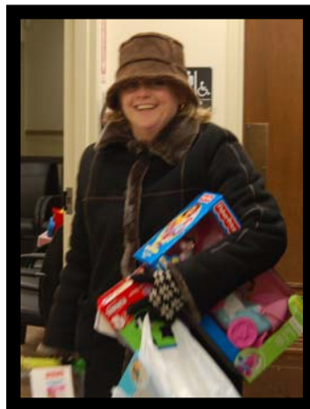
Students and staff from Coretta Scott King Magnet School in University Park, IL sorted gifts and were a great help during the Holiday Gift Express!