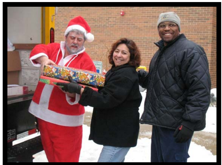
On a cold winter day, Chiro One Wellness Centers delivered a truck full of gifts with Santa to help! Chiro One was instrumental in making this year's Holiday Gift one of the best yet for many of the children, youth & families in Aunt Martha's programs!