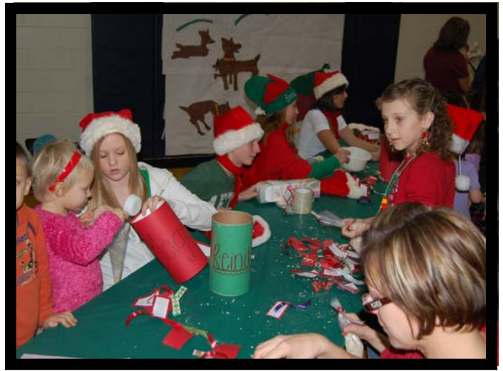
A special thanks to all the students and faculty who made the Drauden Point Middle School Santa's Workshop a HUGE success!